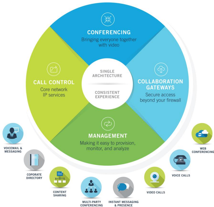
Figure 1. Cisco Collaboration Core Infrastructure

The four key components of the Cisco collaboration core infrastructure: