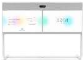
Room 55 Dual (two 55" displays) for medium/large rooms