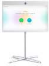
Room 55 (one 55" display) for small/medium rooms