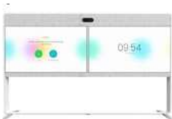
Room 70 G2 Dual (dual 70" display) for medium/large rooms