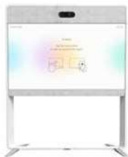
Room 70 G2 Single (one 70" display) for medium/large rooms