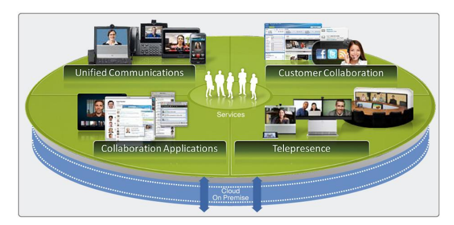
Figure 3. The Collaboration Portfolio

To capitalize on the power of collaboration, you need a broad portfolio of technologies that work transparently together. They should support your company's specific business processes and the ways in which your people interact. The end goal is an integrated and natural collaboration experience for end users, whether they are employees in a bank, customers in a store, forklift operators on the manufacturing floor, or contractors in a home office.